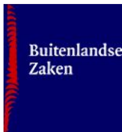
Dutch Ministry of Foreign Affairs

NPA thanks its donors for the 2007 funding period: