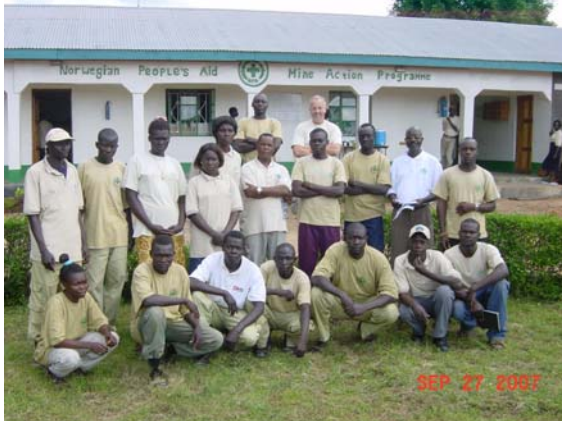
NPA Sudan Team and Section Leader Training

The total area for Cancellation was 754,616m 2 . Reduction during the Third Quarter was carried out solely by the MineWolf and 200,992m 2 was covered. Clearance was effected by the Manual Teams and by the MineWolf and 289,989m 2 covered. Items found and destroyed were: AP – 58, AT - 16, UXO - 147. The BAC team, prior to the completion of the Mundri task, conducted 54,100m 2 of sub-surface clearance. 10 PM1 sub-munitions were located. The EOD teams carried out 17 tasks both in support of the operations and independently.