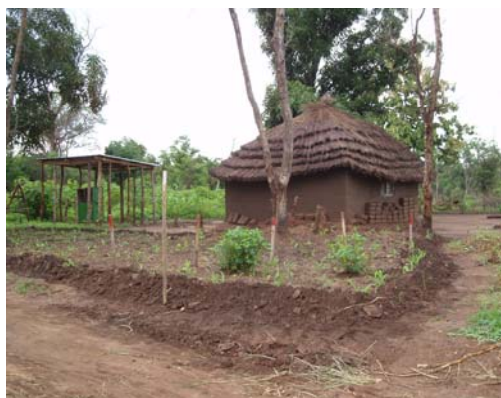
Mundri, Western Equatoria

The Programme was able to facilitate a field visit for the UNDP-SSDC workshop 'Capacity-Development for Mine Action Management' at the integrated Mile 38 Task in Juba County. There was excellent co-operation between the Programme and the UN Mine Action Office for the Annual Accreditation.