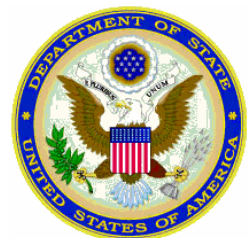
US Department of State