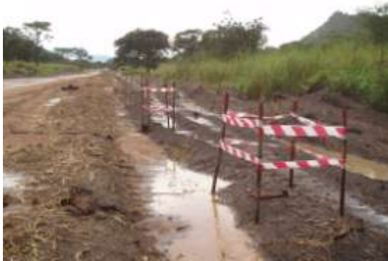
UXO contamination at SS 601, Liria Road, Juba County

The survey teams are engaged in 're-surveys' of the Yei-Bele and Yei-Morobo corridors – the objective of these projects is to clean up existing survey information within the IMSMA database. A number of Cancellations have been made and the scale of many existing Dangerous Areas (DAs) has been reduced; a small number of new discoveries have also been made.