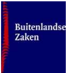
Dutch Ministry of Foreign Affairs

NPA Mine Action Sudan thanks its donors for the 2008 funding period: