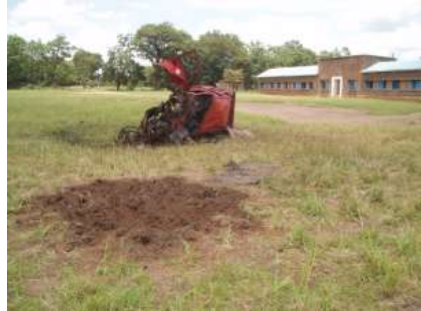
AT incident at Loka, Lainya County – 21.09.2008

The quarter has been marked by an incident which took place in immediate proximity to Loka Senior Secondary School in Lainya County, Central Equatoria. On Sunday 21 September, one person was killed and two others seriously injured when a small truck detonated an Anti-Tank mine – the vehicle was being used for driving lessons. The incident is a grave reminder of the mine hazard that continues to hamper the development of South Sudan. The fact that the incident took place in proximity to the Yei-Juba road also serves as a reminder to the precautions that need to be observed - namely to stay on known tracks.