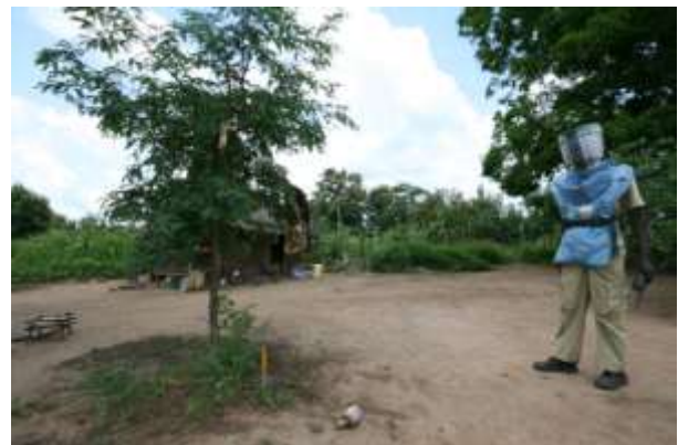
PM1 findings at SS 576, Mundri West

The task itself was being prepared for handover when the incident happened; the Programme Manager and SSDC representatives handed over the task on 25 September.