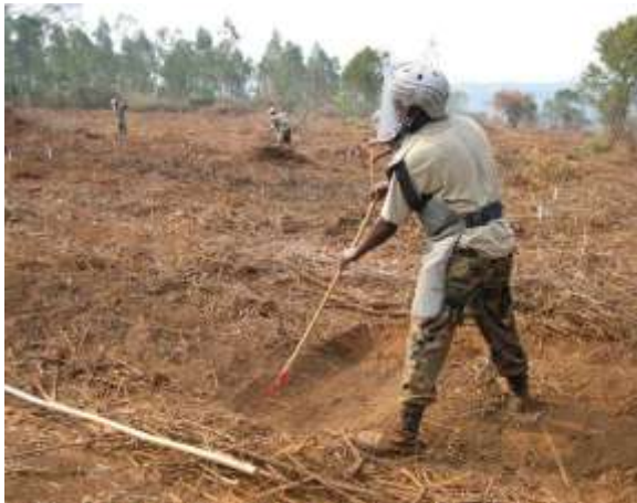
NDO Deminer conducts REDS drill