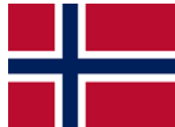
Government of Norway