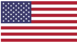
United States Department of State United States Department of Defense