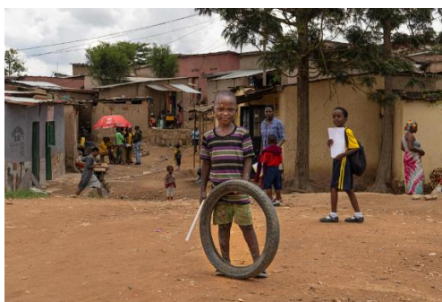
A child playing on the outskirts of Kigali, Rwanda, on Oct. 17, 2019.

Through NPA support, a PPIMA Partners coalition has influenced MINEDUC and MINALOC on the provision of limited playgrounds in schools/communities, an issue identified through the Community Score Card (CSC) process and elevated to the national level.